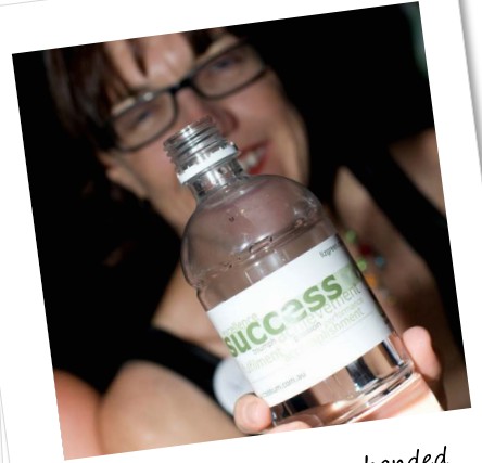
Bottles of Success were handed out with the gift bags.