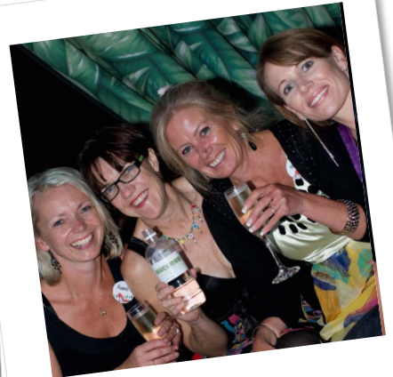
It was a great night for socialising and networking.