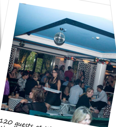
120 guests at Kit & Kaboodle, Kings Cross.