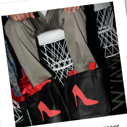
The gift bags doubled as a spare pair of high heel shoes for some!