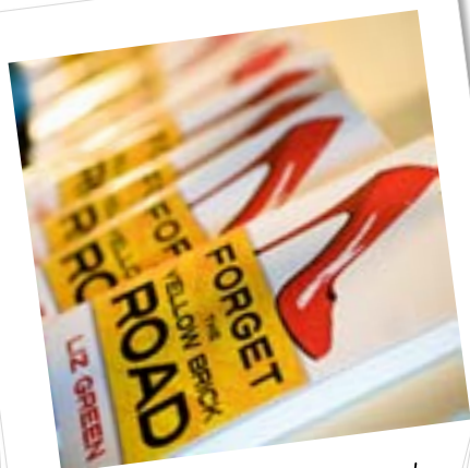
Forget the Yellow Brick Road by Liz Green

www.successium.com.au contactus@successium.com.au